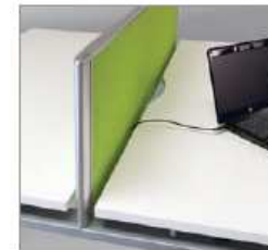
Chair shown is the living chair

The scalloped desk edge and 12mm access gap allow for easy access of wires and cables